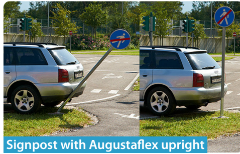
Signpost with Augustaflex upright